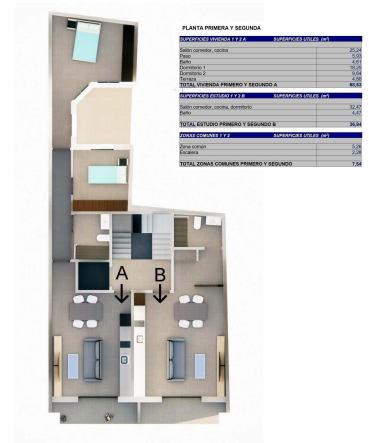
Planta Primera y segunda. Estudio B y Vivienda A